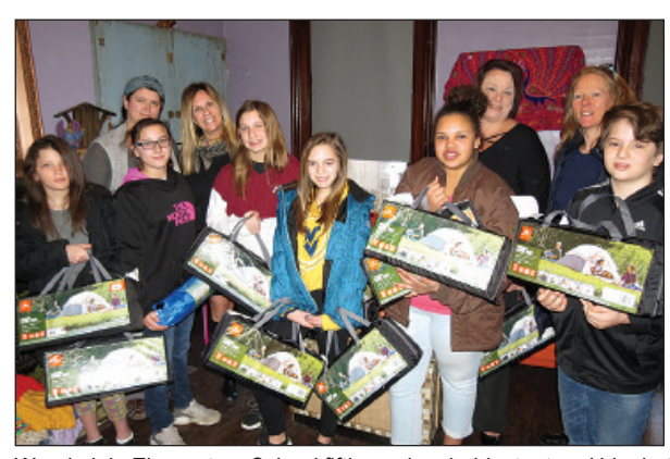
Woodsdale Elementary School fifth-graders held a tent and blanket drive as the Winter Freeze Shelter prepared to close for the season in March 2019.

Number of individual guests who stayed at the shelter in 2018-19