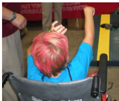
Cornhole toss from a wheelchair—Celebrate Youth 2011

been like if you were living at Helinski, a resident of the Northern Regional Juvenile Center, or facing adulthood without someone holding a net for you, in case you fall.