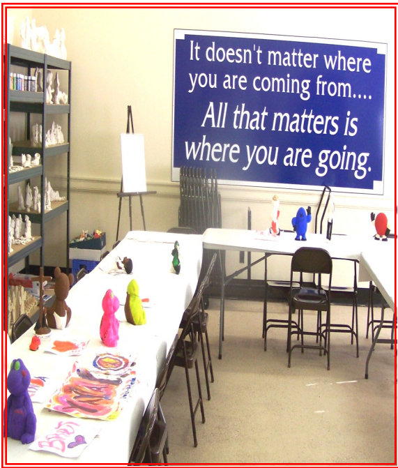
Crafts Room, Northern Regional Juvenile Center