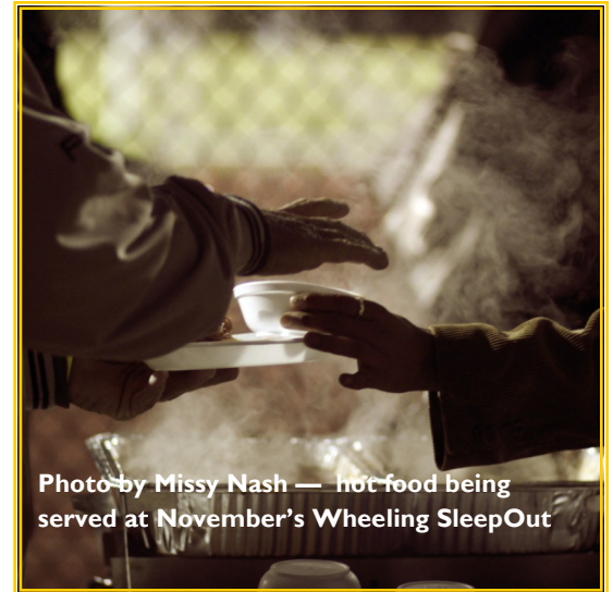
hot food being served at November's Wheeling SleepOut

⇒ Tuel Center is YSS's Transitional Living Training Center in New Martinsville