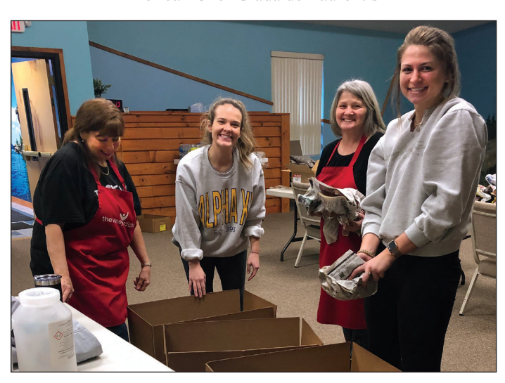
Volunteers from the Vineyard Church prepare to pack boxes with food they prepared for the Winter Freeze Shelter.