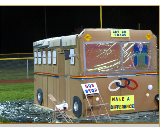
Boxed In Design Winner for 2013—Wheeling Oddfellows—Wheeling SleepOut

After School –Before School Care & Community Child Care: 203;