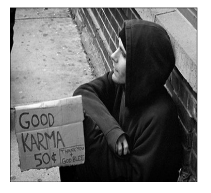
Street youth seeking help